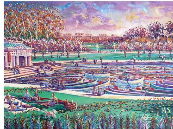
"Boat Regatta at Versailles" Oil on canvas, 12 x 16 inches