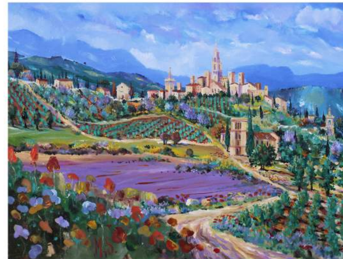
“Poppy Fields of Sant'Antimo” Oil on canvas, 18 x 24 inches