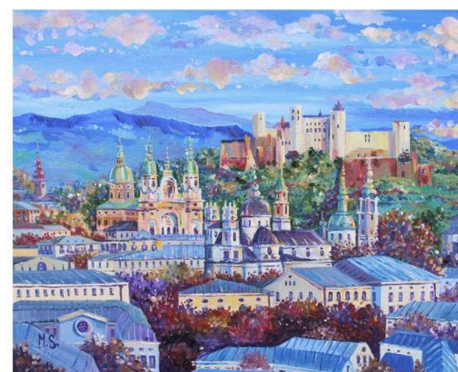
"Old Town Salzburg, Fall" Oil on canvas, 16 x 20 inches