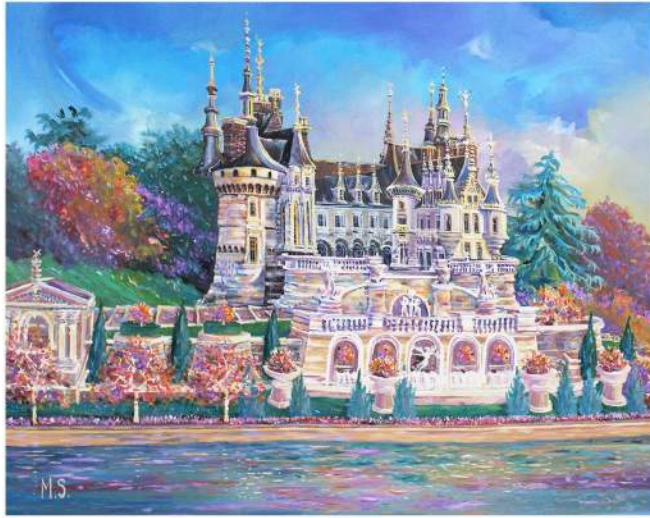
"Crown of the Loire" Oil on canvas, 24 x 30 inches