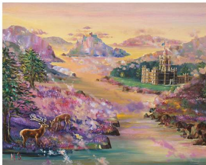
"Highland Dream" Oil on canvas, 22 x 28 inches