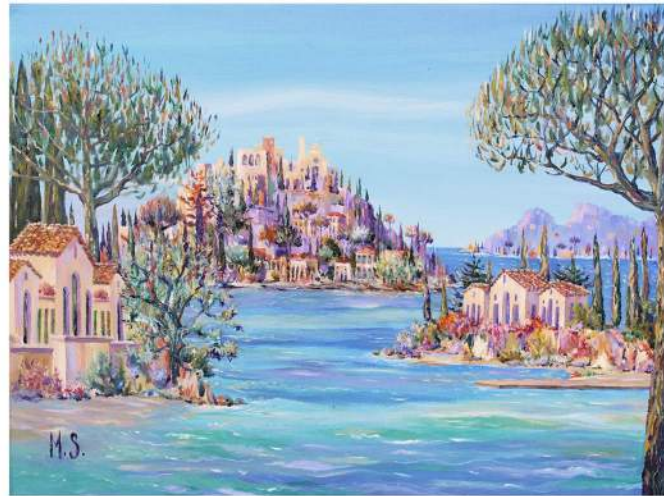
"Dream in Corfu" Oil on canvas, 18 x 24 inches