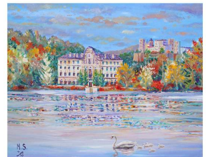
"Life is Good" Oil on canvas, 16 x 20 inches