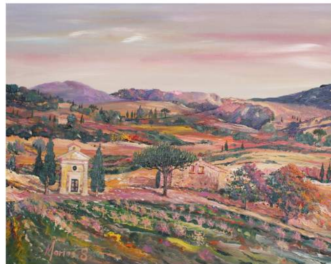
“Jewel in Hills, Val d'Orcia” Oil on canvas, 24 x 30 inches