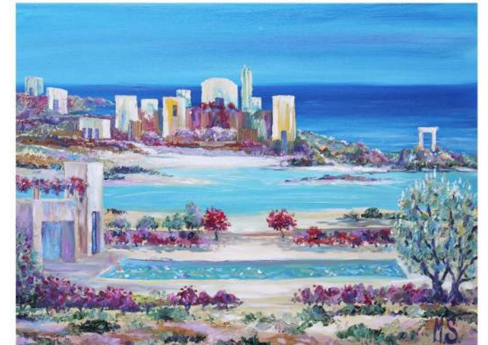
"Dream on White Sand" Oil on canvas, 18 x 24 inches