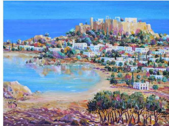
"Lindos, Rhodes" Oil on canvas, 18 x 24 inches