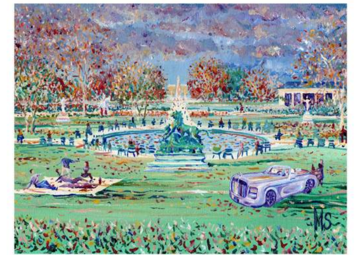
"Picnic at Tuilleries Gardens" Oil on canvas, 12 x 16 inches