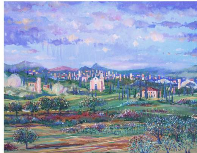
“Val d'Orcia” Oil on canvas, 14 x 18 inches