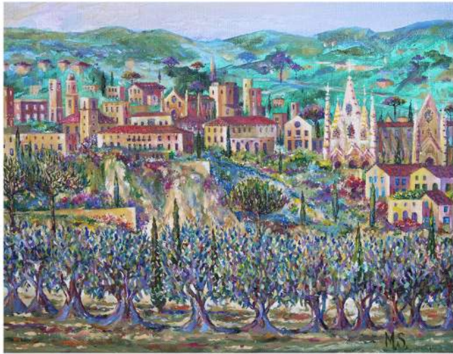
“Olive Groves of Orvieto” Oil on canvas, 14 x 18 inches