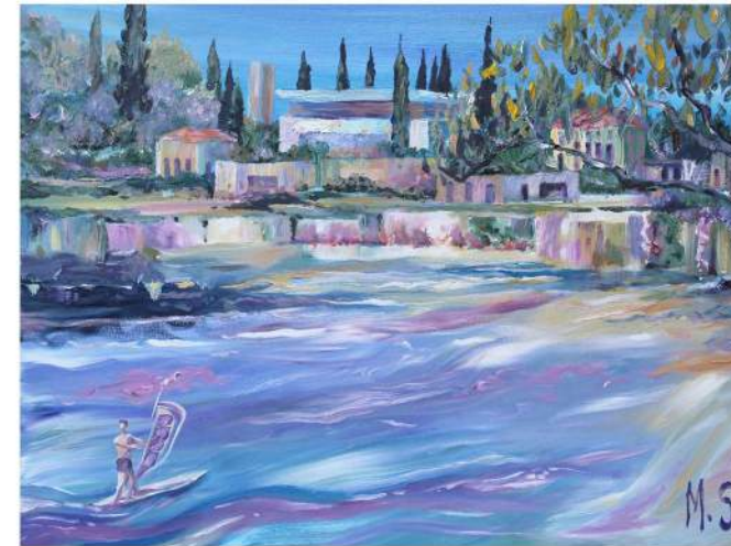
"Peaceful Cove, Attica" Oil on canvas, 18 x 24 inches