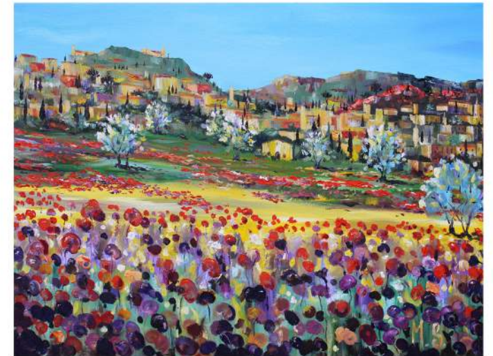
“The Fields of Assisi” Oil on canvas, 18 x 24 inches