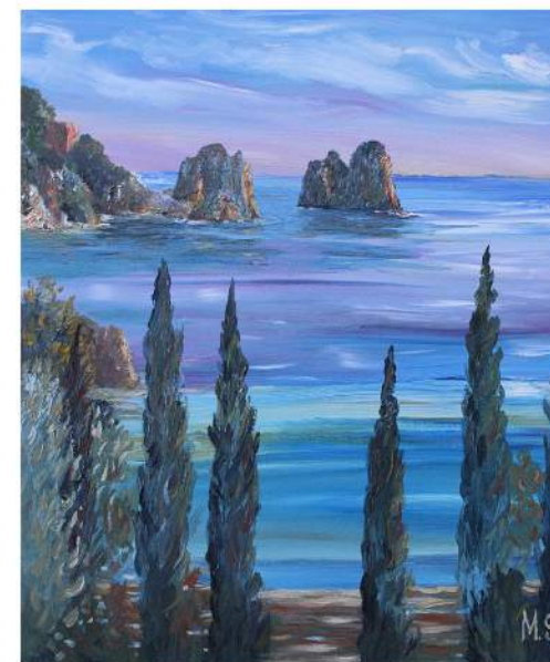
“Afternoon in Capri” Oil on canvas, 20 x 24 inches