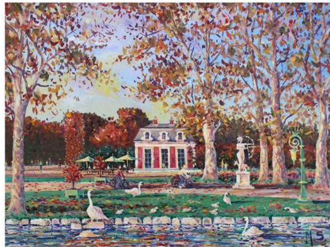
"Pavilion at Versailles" Oil on canvas, 12 x 16 inches