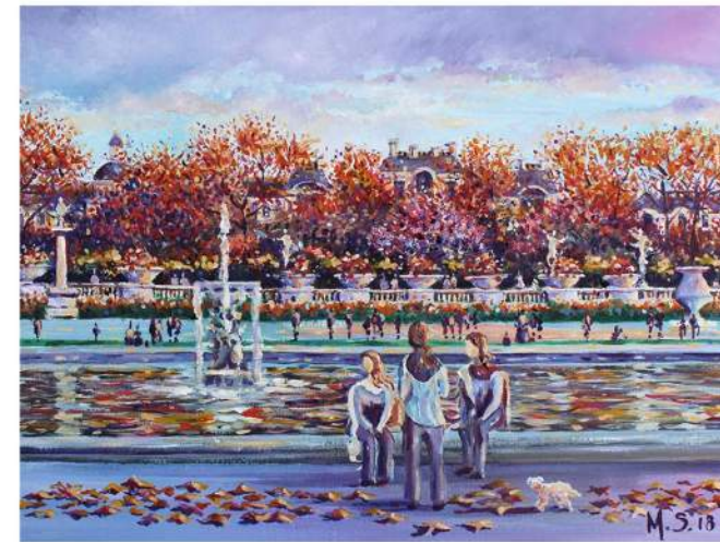
"Fall at Luxemburg Gardens" Oil on canvas, 12 x 16 inches