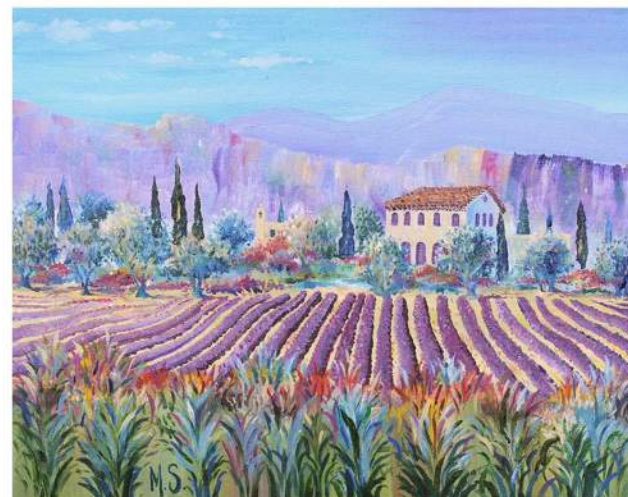
"Lavender Fields" Oil on canvas, 16 x 20 inches