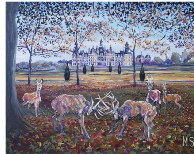
"Sunday Afternoon Play" Oil on canvas, 24 x 30 inches