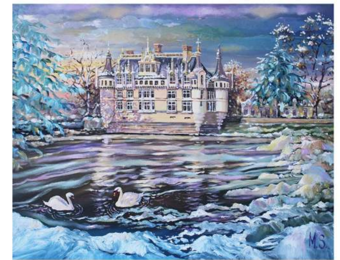
"Winter Dream" Oil on canvas, 24 x 30 inches